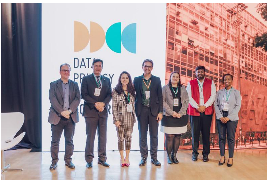
Representatives from the Steering Committee organisations stand with panellists after the opening session of the Data Privacy Global Conference in Sao Paulo, Brazil.

The Alliance supported members of the alliance to join the Data Privacy Global Conference (DPGC), which was held in Sao Paulo in Brazil from November 25 and 26, 2024. The Conference is an annual convening that brings together experts, policymakers, and industry professionals to discuss the latest trends and challenges in data protection and governance. The Alliance's steering committee participated in an opening panel to set the tone for the Conference, focusing on Data Protection and Governance. A total of 418 attendees participated at the DPGC