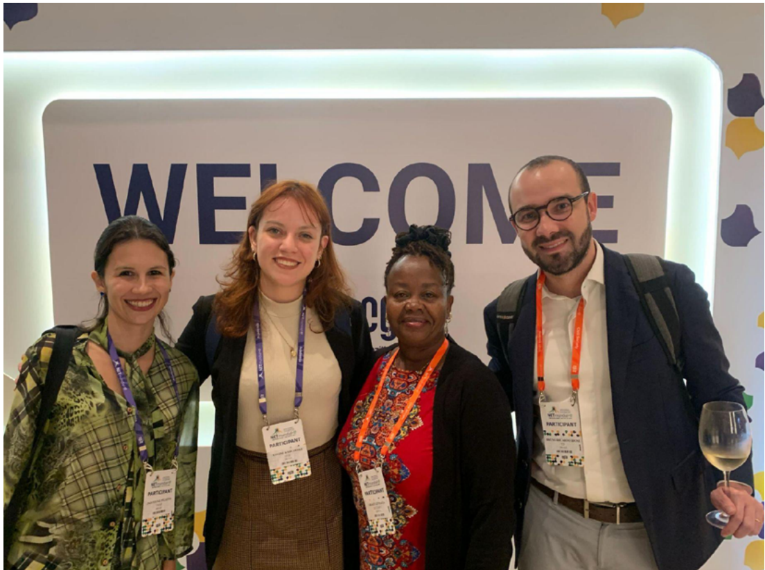
Global South Alliance members during the Net Mundial+10 event in Sao Paulo, Brazil

Members of the Global South Alliance who attended the meeting discussed the declaration and were able to bring up the issue of reinforcing regional and international Internet Governance Forums. The official NETmundial+10 Multistakeholder Statement is available here .