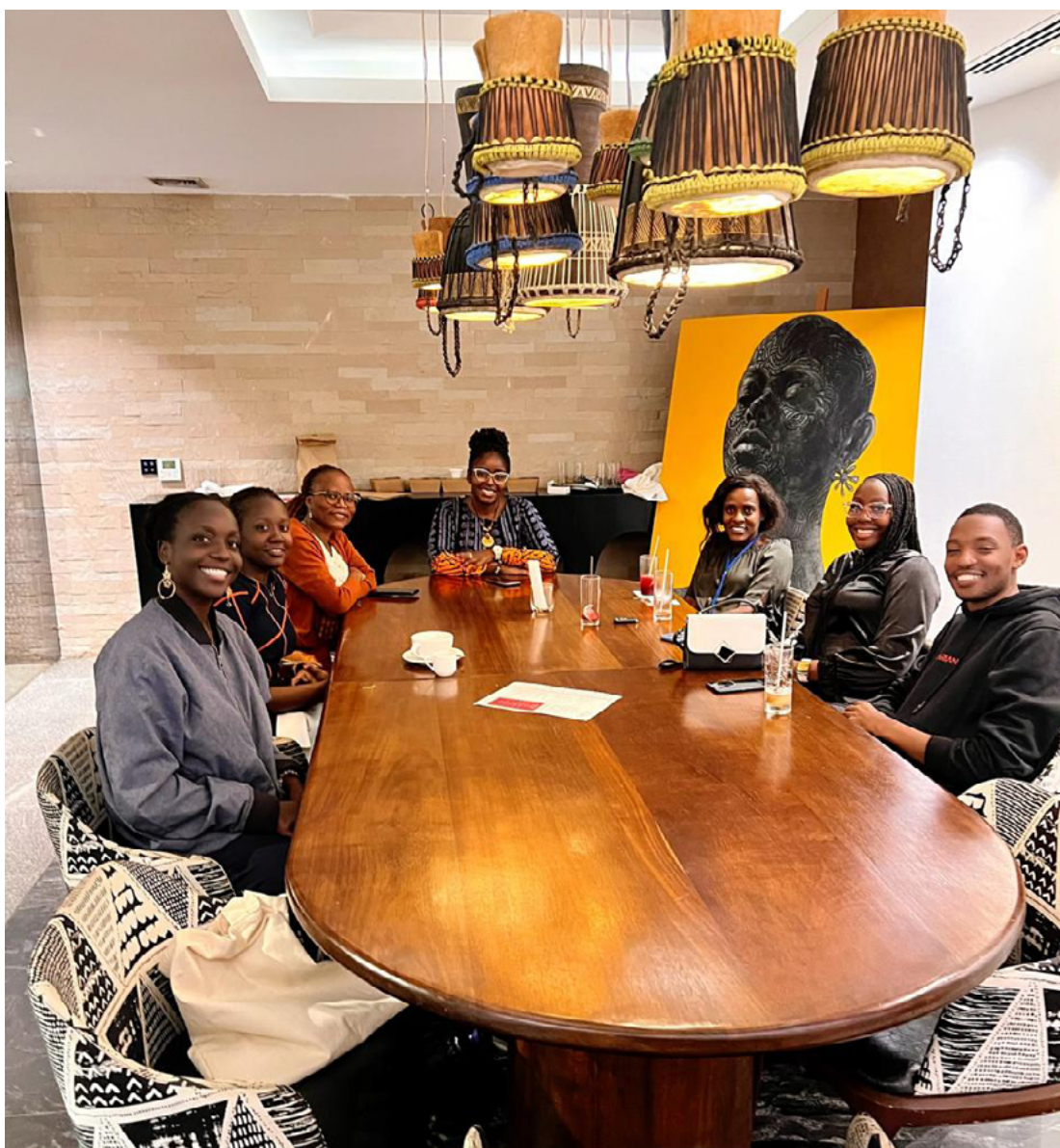
GSA members hold a networking meeting during the UN Civil Society Conference in Nairobi, Kenya.