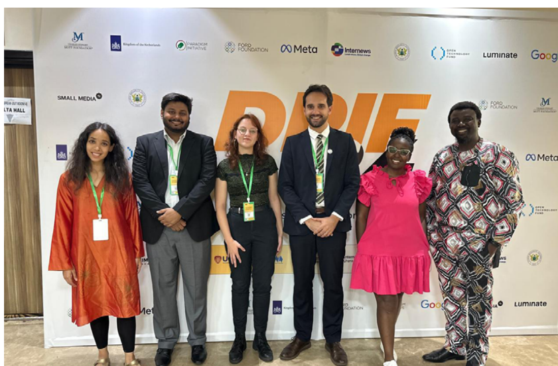
Representatives from the Steering Committee organisations pose for a photo on the sidelines of the Digital Rights and Inclusion Forum in Accra, Ghana.

Members also deliberated on admitting new organisations to the Alliance, agreeing to host open meetings to gauge interest and discuss potential membership.